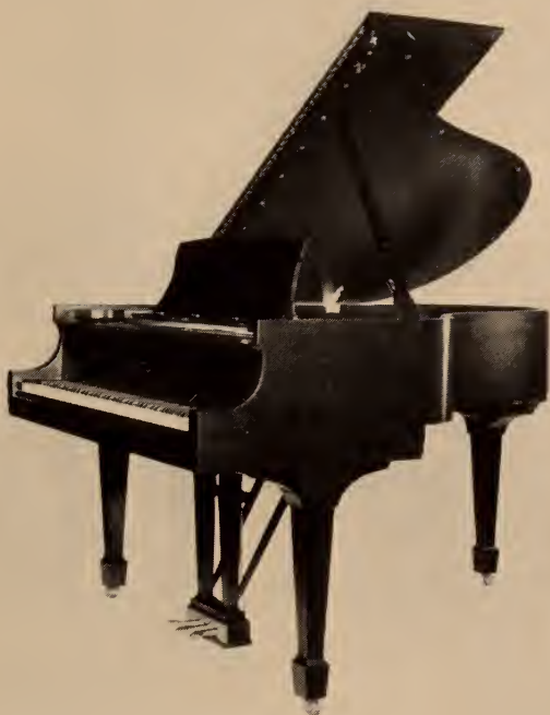
BABY GRAND Model M Length 5 feet, 7 inches