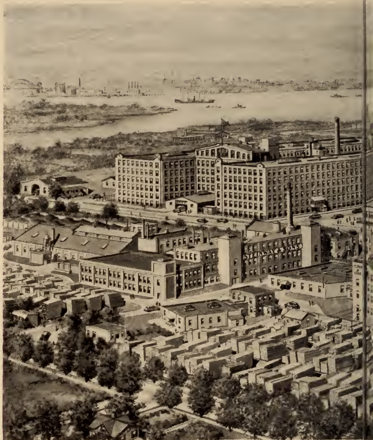
HOME OF THE Consolidated View of GREATER NEW YORK