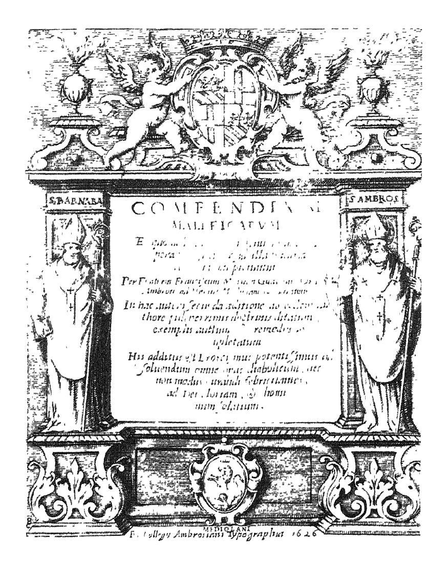
COMPENDIVM MALEFICARVM Francesco-Maria Guazzo Title-page of Second Edition