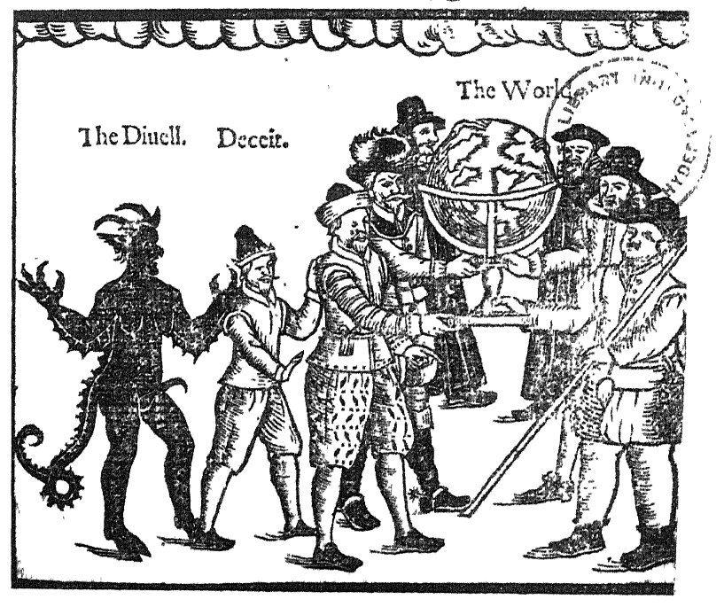
THE WORLD TOST AT TENNIS The First Quarto